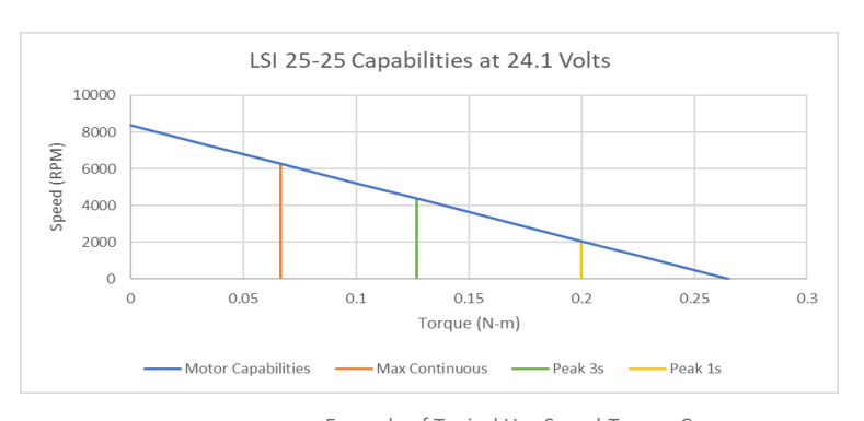
Example of Typical Use Speed-Torque Curve Higher speeds possible and is dependent on the applied voltage. Top speed may be limited mechanically. Please consult factory if higher speeds are required.

ThinGap's frameless motor part set allows it to be completely integrated resulting in the highest ratio of torque-to-volume. In this configuration, the motor's rotor and stator can be housed within the customer's assembly utilizing a common shaft and bearing system, resulting in increased coupling efficiencies, smaller system size and lower weight. Note: stator and rotor assembly requires tooling due the high magnetic strength of ThinGap's rotor designs.